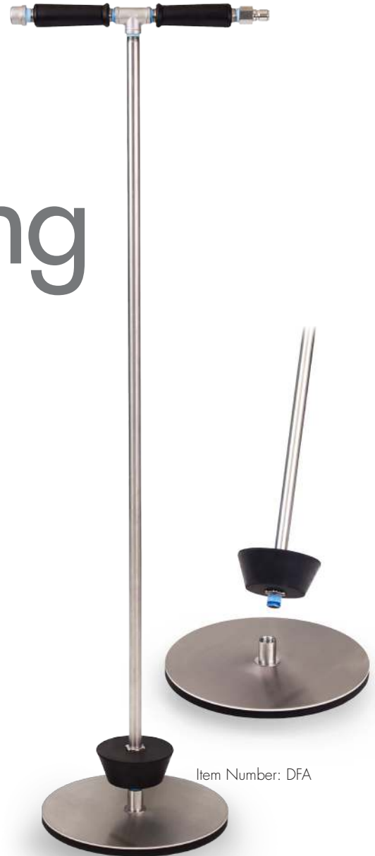
Item Number: DFA