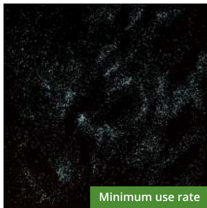
Minimum use rate

ProvaStride applied to the floor at 2.0 oz/100 ft 2 , the minimum labeled use rate